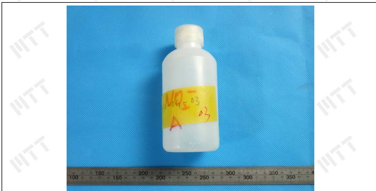
Figure 1. The sample photo of F181102021